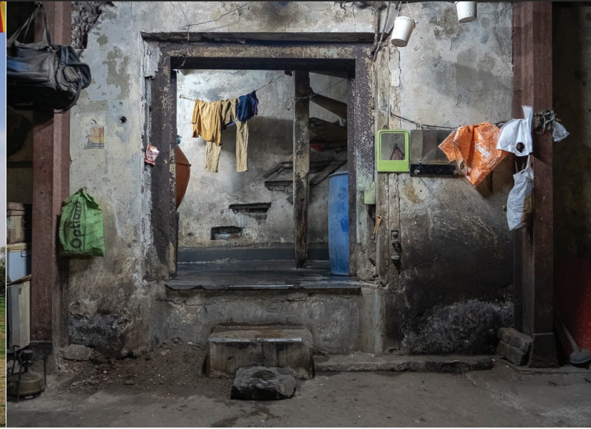
© Luning Cao - Merit Award