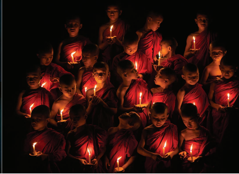
Merit Award