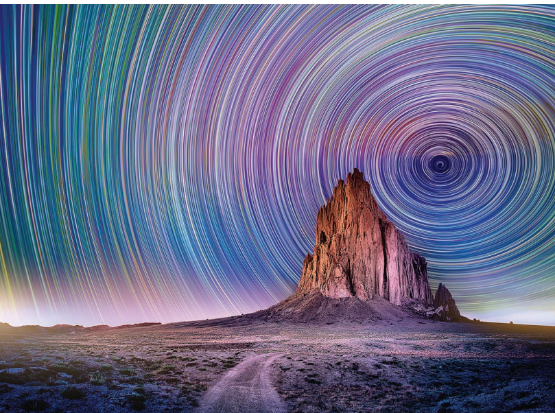
© Vittorio Sancipriano - Merit Award