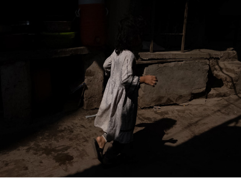
Merit Award