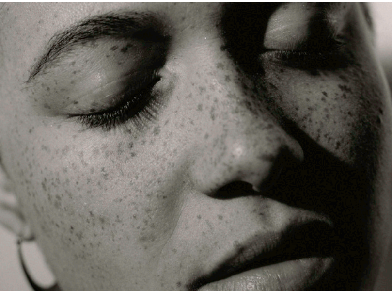
© Julio Marchamalo - Merit Award