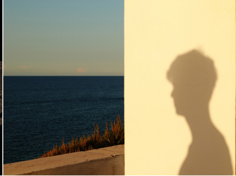
© Luca Regoli - Merit Award