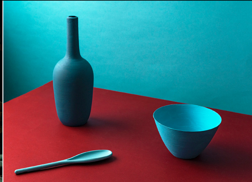
© Olena Zubach - Merit Award