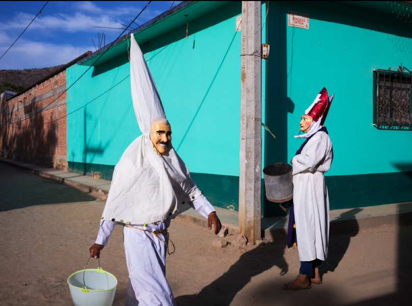
© Edwin Carungay - Merit Award