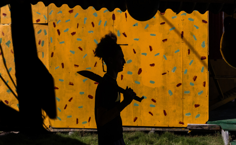
© Nicola Balestrazzi - Merit Award