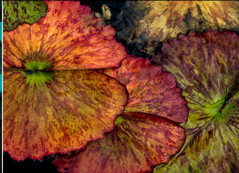
Merit Award