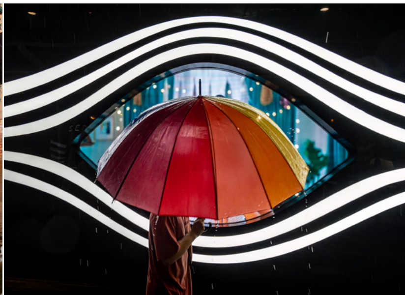
Media Contact: awards@all-about-photo.com