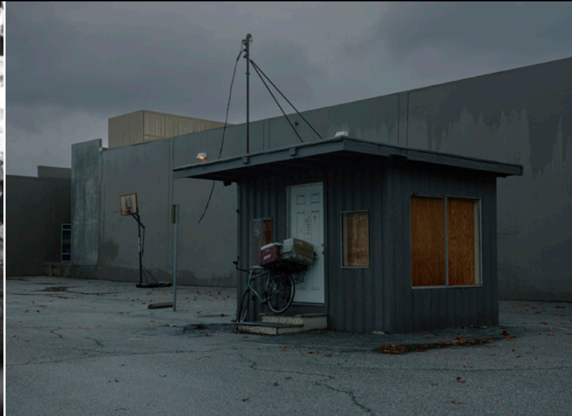
Merit Award