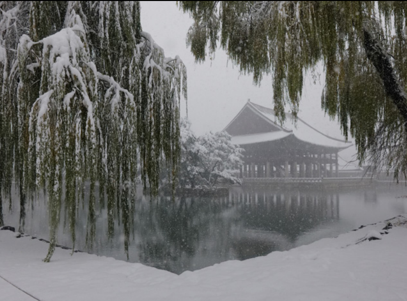
© Jaejoon Ha - Merit Award