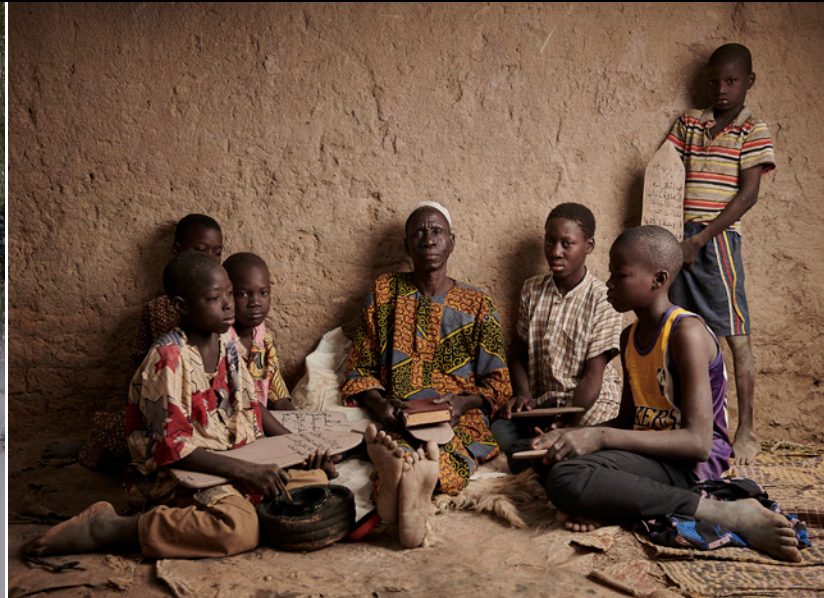
© Marios Forsos - Merit Award