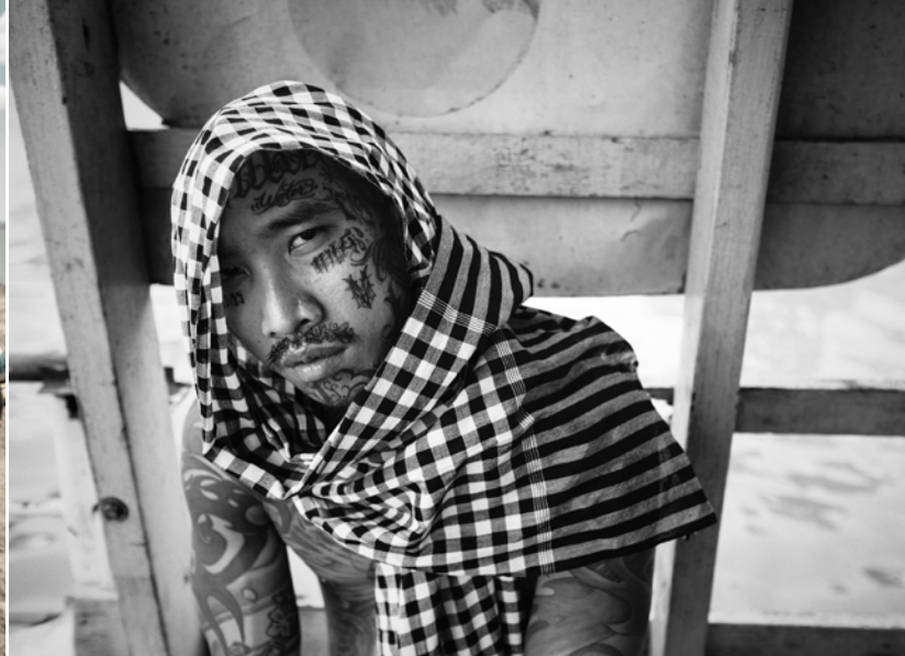
Merit Award