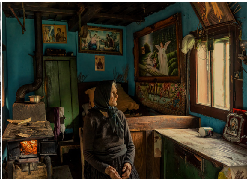
Merit Award